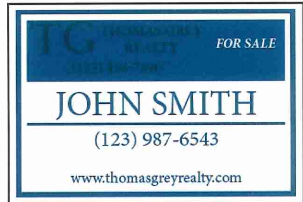
This advertisement is not in compliance because the broker name and phone number are "ghosted" due to poor color contrast, making them too difficult to read.