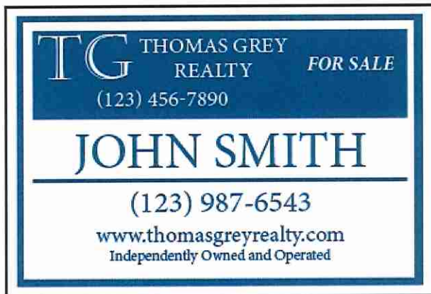
Advertisement is in compliance because it is clear to the general public who the broker is.