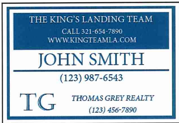
Advertisement is in compliance because it is clear to the general public who the broker is.

Note: In accordance with Chapter 19. 1909 and Chapter 25. 2501(F), this must be a phone number owned by the broker(age) that enables the public to directly contact the broker without having to go through the affiliated licensees listed in the advertisement.