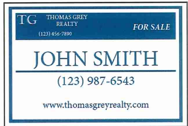
This advertisement is not in compliance because the broker name and phone number are not conspicuous, discernible, and easily identifiable.