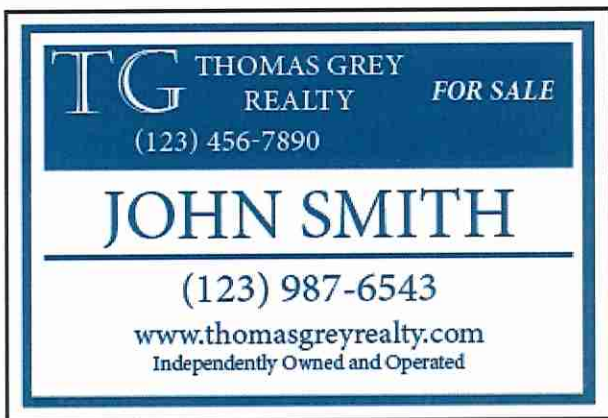
Advertisement is in compliance because it is clear to the general public who the broker is.