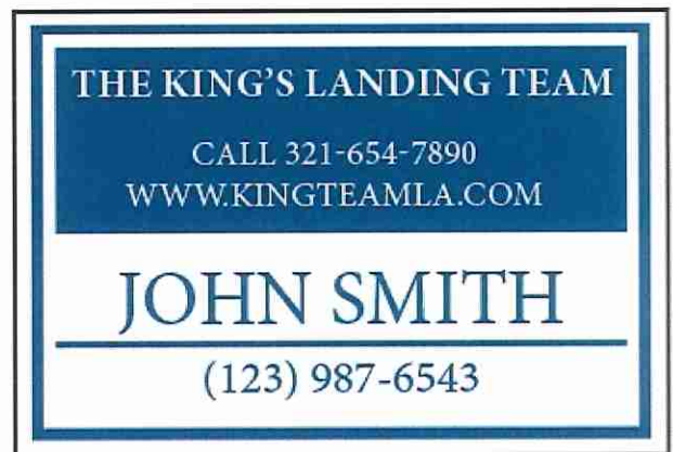
This advertisement is not in compliance because the broker name and phone number are not included.

2) Does the advertisement use only team names approved by the sponsoring broker? Yes ___ No ___